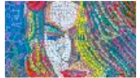
MOSAIC THE HEART OF JESUS For Women