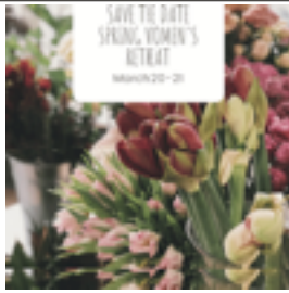
SAVE THE DATE