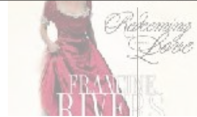
BOOK OF THE MONTH